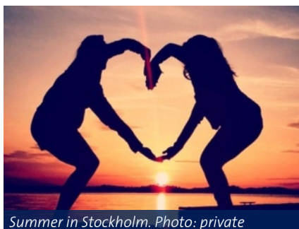
Summer in Stockholm.