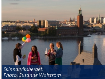
Skinnarviksberget.