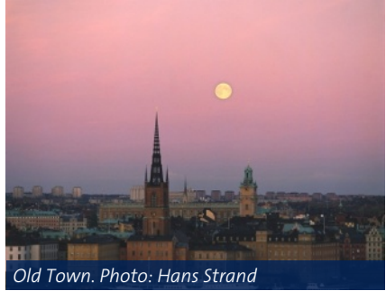
Old Town.