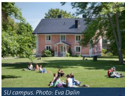
SU campus.