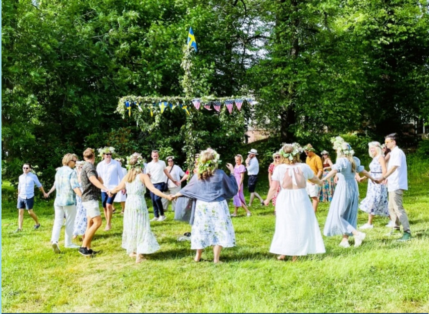
Midsummer dancing