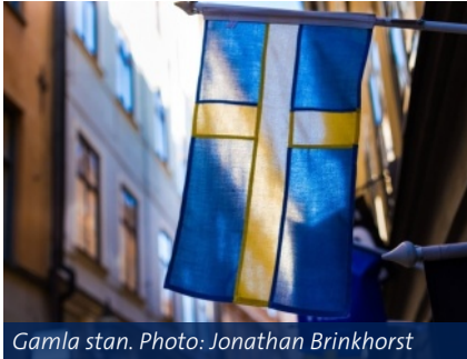
Gamla stan.