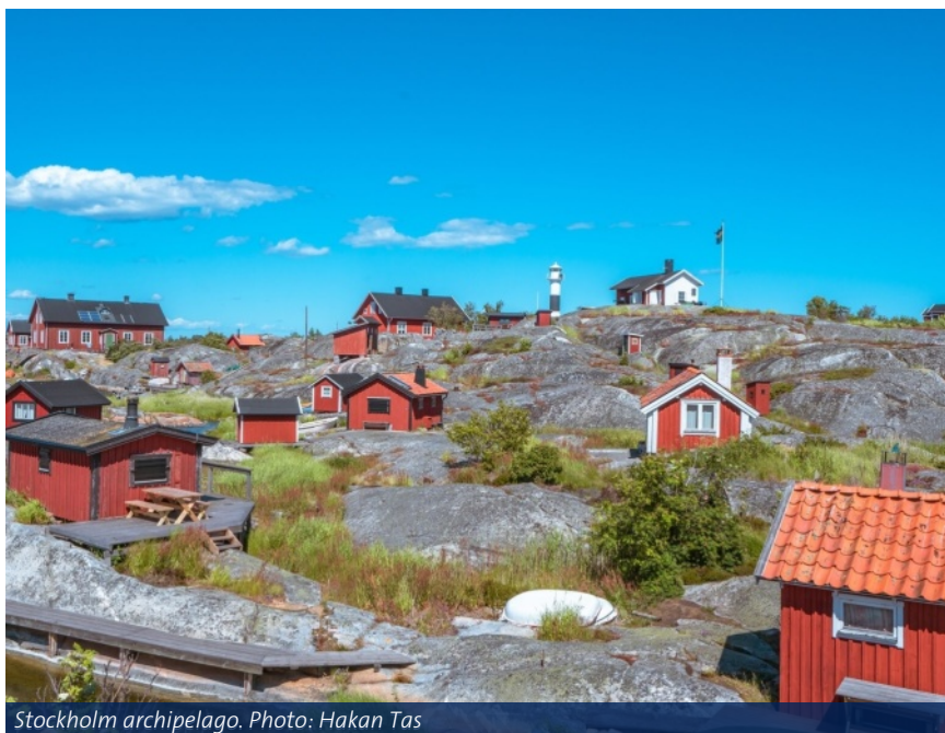
Stockholm archipelago.