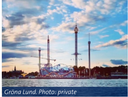
Gröna Lund.