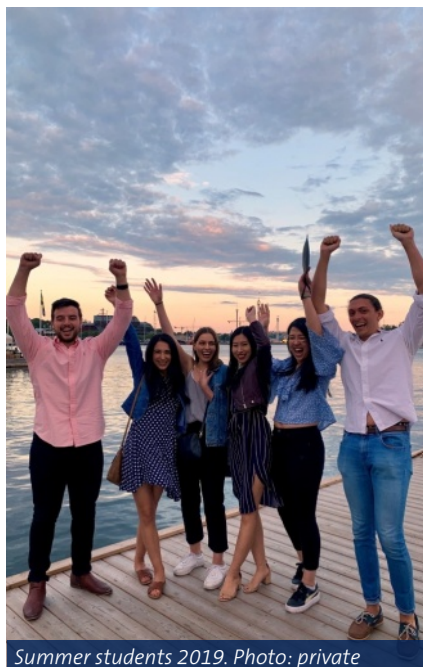
Summer students 2019.