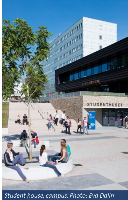
Student house, campus.