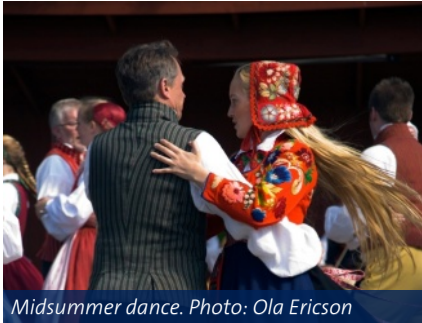
Midsummer dance.