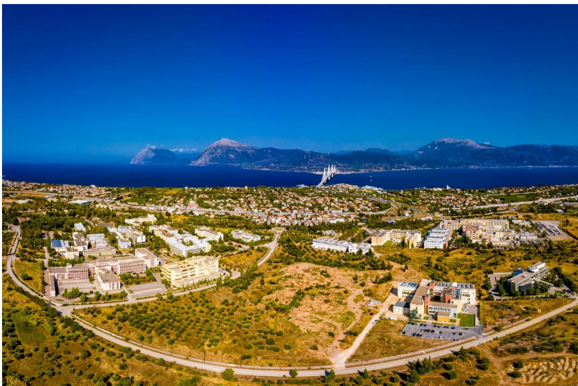
University of Patras, Rio Campus

University of Patras Students Social Welfare: https://socialwelfare.upatras.gr/?lang=en