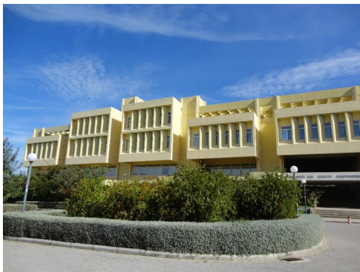
Library & Information Center

Both courses are offered free of charge.