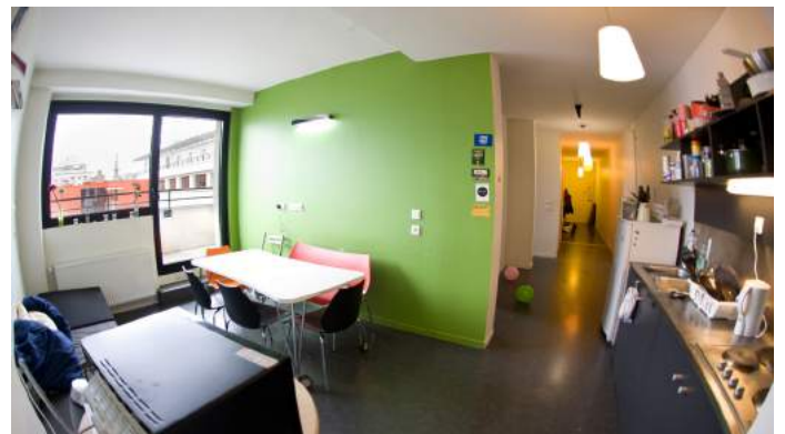
Shared apartment at the Maison des étudiants (CROUS)

+ www.crous-grenoble.fr/demanderunlogement/ http://www.crous-grenoble.fr/demanderunlogement/logement-etudiant-international/