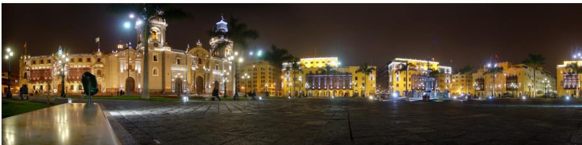
Historic Centre of Lima

Museums with great works of art, archaeological sites, beaches, the boardwalk, valleys, natural reserves, the nightlife, the thrill of adventure sports and the exquisite cuisine gives Peru's capital an authentic personality and makes tourism in Lima a unique experience in the country.