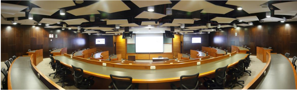
Aula Magna – Universidad del Pacífico

Universidad del Pacífico (UP) is a private university established in 1962 by a group of Peruvian entrepreneurs supported by the Jesuit community. Today it has become a university specialized in the areas of economics and business administration. In the past three decades, UP has been ranked as the most prestigious higher education institution in its fields of specialization in Peru, and among the leading institutions of its kind in the Latin American region.