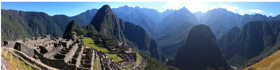
Historic Sanctuary of Machu Picchu

The ancient capital city of the Tahuantinsuyo is a place of intense contrasts and the seduction of its magnificent Inca walls, crowned by Spanish-styled balconies and tile roofs are a testimony of its legacy: a mixture that enriches itself with the energy that irradiates from the religious buildings, all of them adorned with priceless works of art. The creativity of artisans and festivities such as Corpus Christi and Inti Raymi , celebrate the communion between Christian and ancestral traditions that is hard to find anywhere else. Rejoice, you just have arrived to the center of the world.