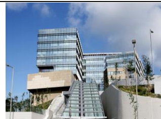
Photo: Lee Shau Kee Business Building